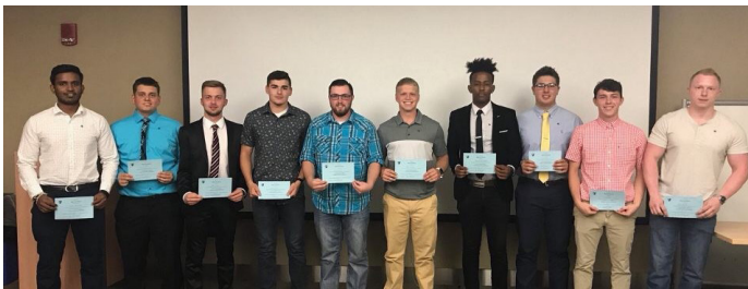
Slippy Rock, Beta Tau *pictured above 12 Associate Members