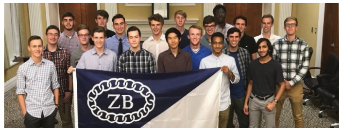
Cincinnati, Zeta Beta *pictured above 20 Associate Members