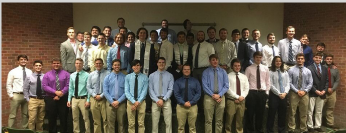
Southeastern Louisiana, Phi Chapter *pictured above 16 Associate Members

Congratulations to these five chapters for their outstanding efforts to recruit the newest Noble Men of Sigma Tau Gamma. Make sure to follow our social media accounts, as well as the SAGA Monthly for continued recruitment updates.