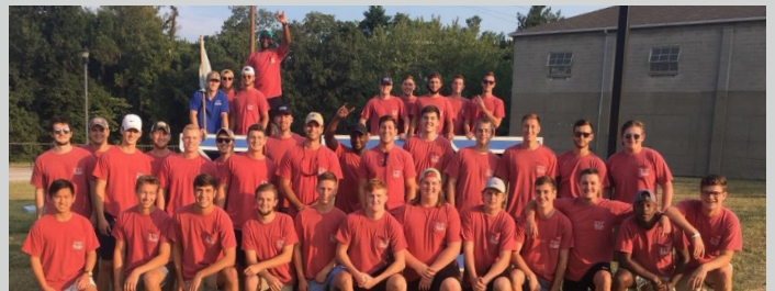
Southeast Missouri, Alpha Phi Chapter *pictured above 16 Associate Members