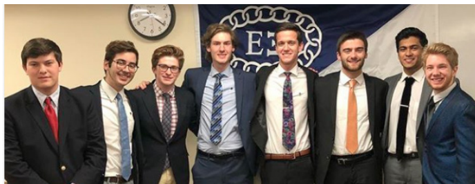
Saint Louis, Epsilon Xi Chapter *pictured above Eight Associate Members

Congratulations to these four chapters for their outstanding efforts to recruit the newest Noble Men of Sigma Tau Gamma. Make sure to follow our social media accounts, as well as the SAGA Monthly for continued recruitment updates.