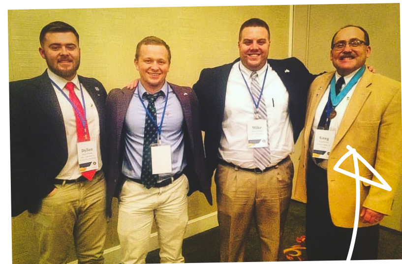
2016 - Webb Academy in Kansas City,