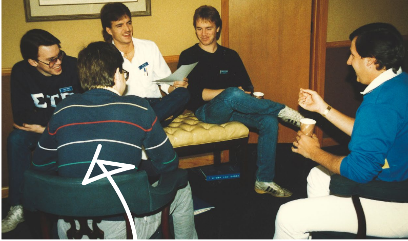
1980's - Webb Academy in