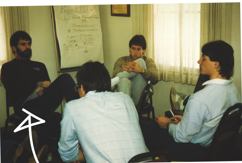
1980's - Webb Academy in