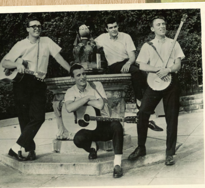
THE TOWNMEN FOUR