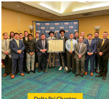
Delta Psi Chapter