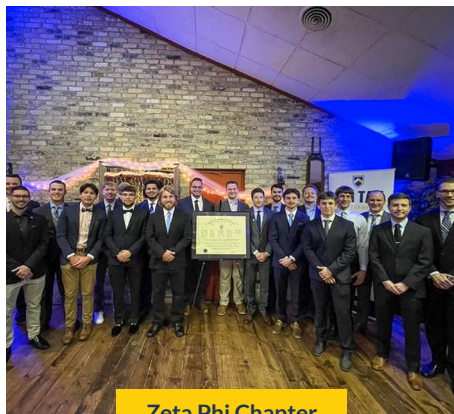
Zeta Phi Chapter