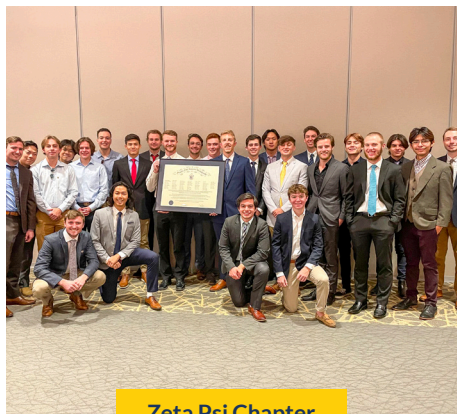
Zeta Psi Chapter