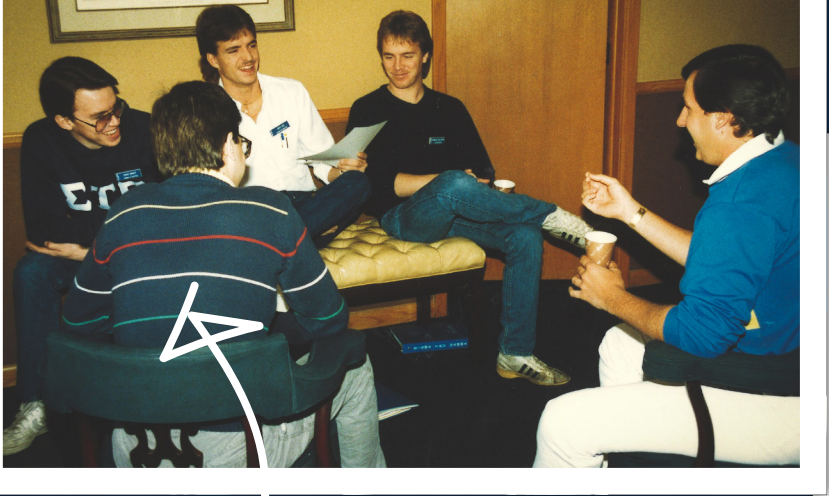
1980's - Webb Academy in Warrensburg, MO