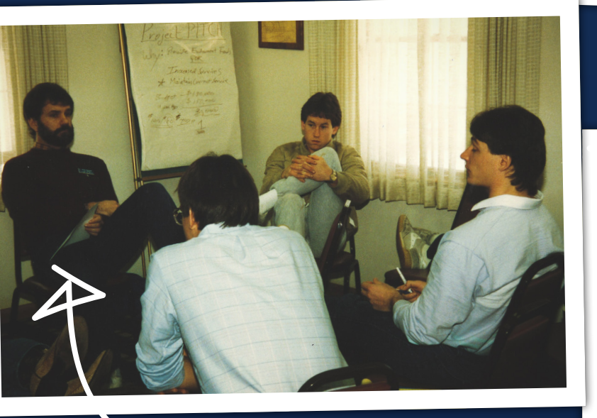
1980's - Webb Academy in Warrensburg, MO