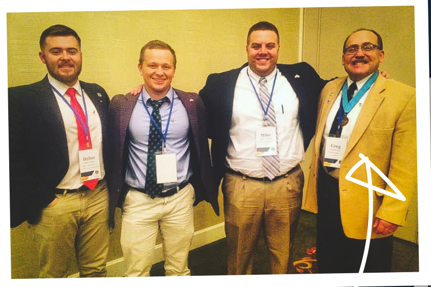
2016 - Webb Academy in Kansas City, MO