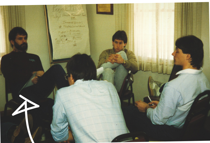
1980's - Webb Academy in Warrensburg, MO