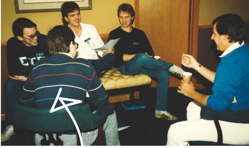
1980's - Webb Academy in Warrensburg, MO