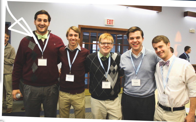
1980's - Webb Academy in Warrensburg, MO